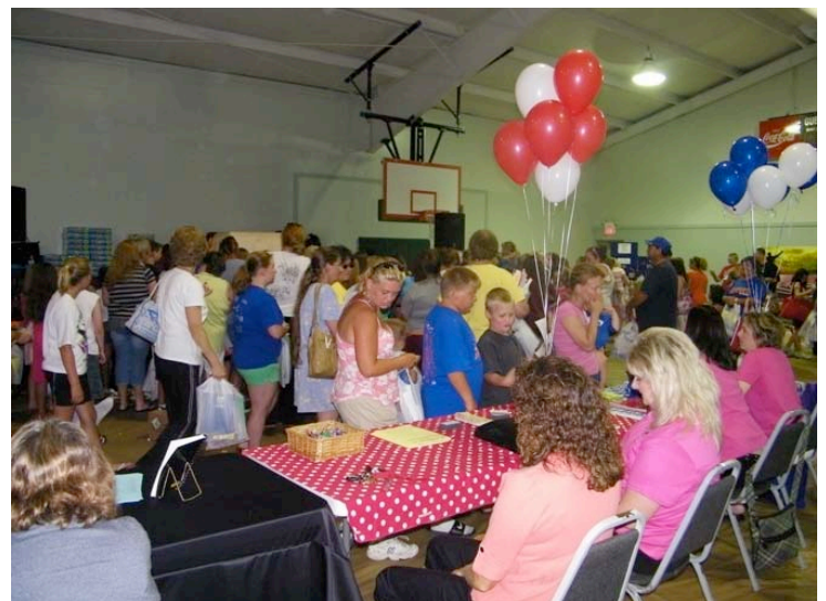
Pictured at Right ~ Victory Christian Church in collaboration with the FRYSC's from Somerset Independent, Science Hill Independent, and Pulaski County Schools hosted their annual Back To School Extravaganza on July 26 th , 2011. The church raises money for this event and the FRYSC assist them in the planning and organizing for the big day. All children in the county are invited to come whether they attend, private school, home schools, or are in the public school systems. The day is fun filled with clowns, inflatables, sno-cones, popcorn and vendors. There is no cost to the children or their families. There are also free haircuts and