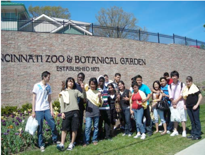
Students from the Fayette County ESL Summer Enrichment Camp