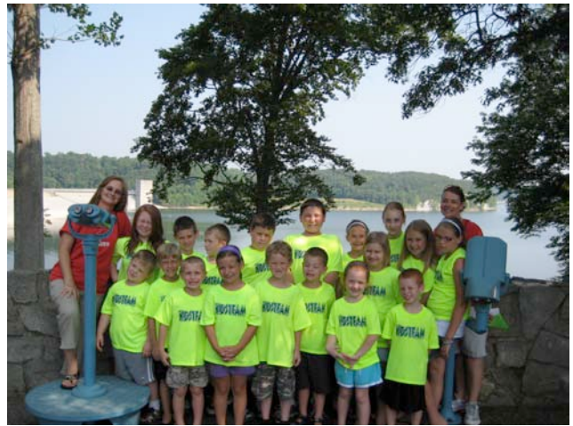
Pictures from the Casey County's FRC KidsTeam Summer Camp's Educational Field Trips