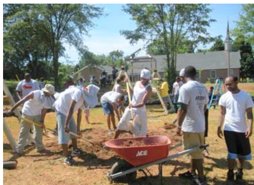
Members of Call Me Mister working on the playground.

On Saturday, June 20, 2009, 35 members of the Call Me Mister program volun-