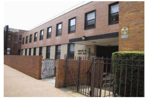
Hour Children Residential Facilities